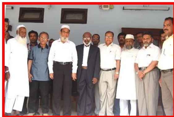
World Health Day at the Department of Community Medicine.