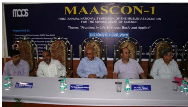
National Symposium on Frontiers in Life